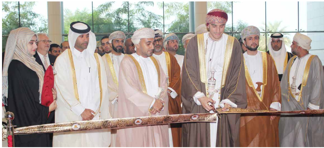
H.H. Sayyid Kamil bin Fahd bin Mahmood Al-Said Assistant Secretary General for the Cabinet of the Deputy Prime Minister for the Council of Ministers in Oman