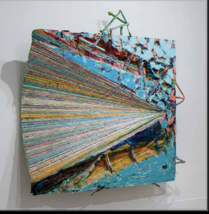
Art & Accessories