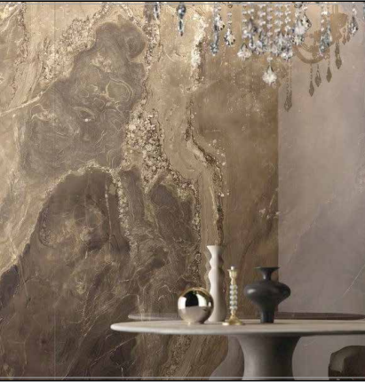
Tile & Stones