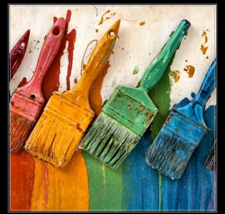
Paint & Coatings