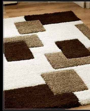
Carpets & Textiles

I would like to take this opportunity to thank you and your team at the IDF for a fantastic show. We are witnessing and overwhelming response from the event and definitely looking for a bigger and better space for 2019.