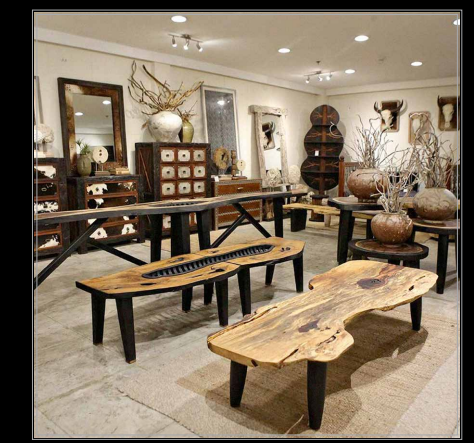
Luxury Life Style