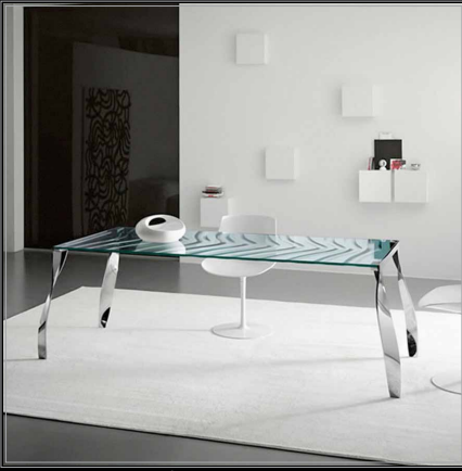
Design & Décor