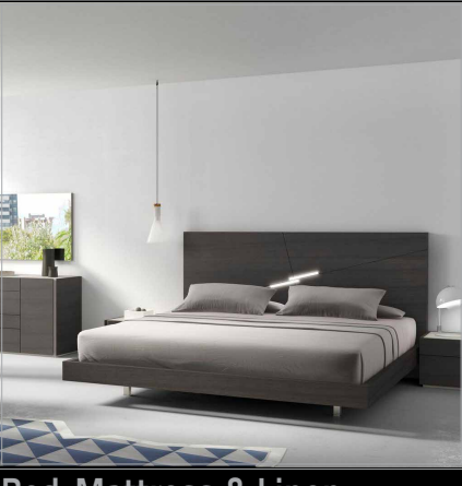
Bed, Mattress & Linen